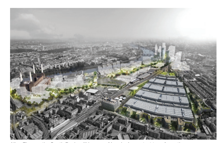
Nine Elms on the South Bank, will be one of London's greatest transformations, becoming an ultra-modern complex offering 16,000 homes and 25,000 jobs, schools, parks, culture and the arts, set over 196 hectares including the iconic Battersea Power Station