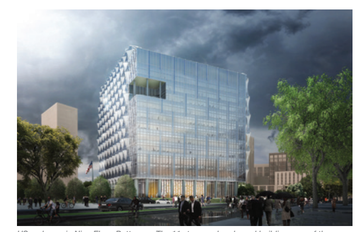
US embassy in Nine Elms, Battersea. The 11 storey cube-shaped building, one of the highest performing energy use and sustainability in the world