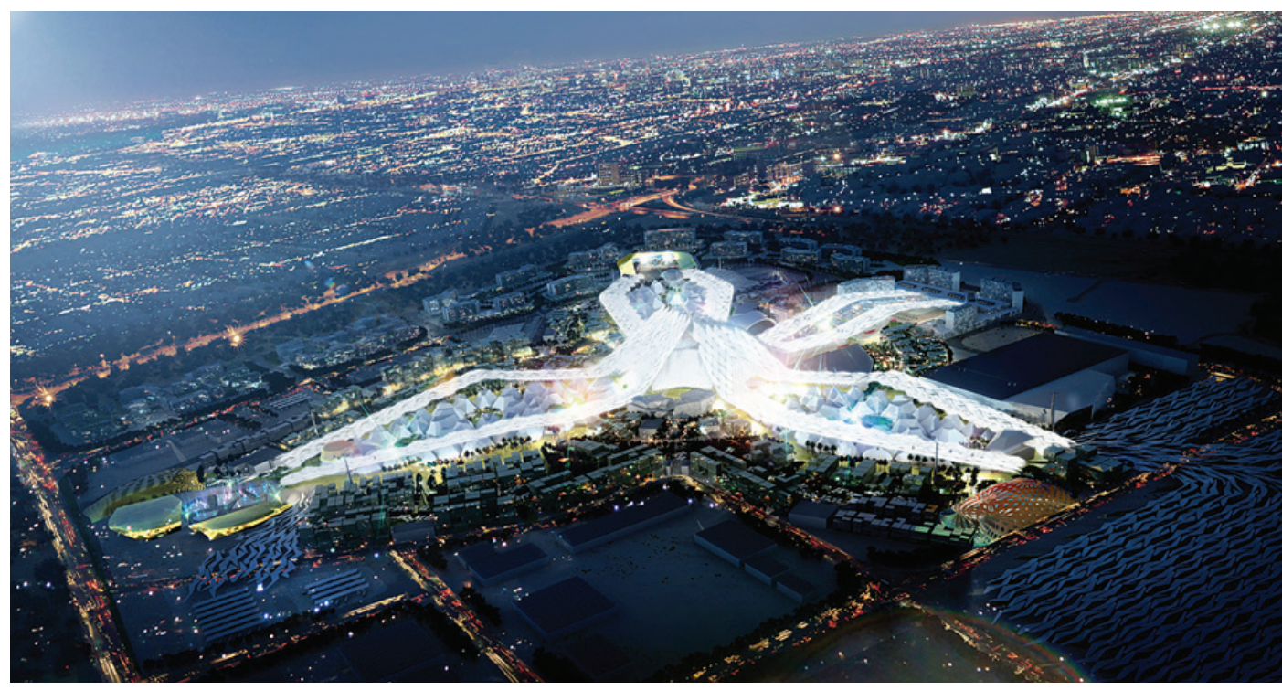
RLB: Expo 2020 Dubai. The United Arab Emirates will host the World Expo in Dubai in 2020. This is the first time that World Expo will be held in MEASA. Dubai's World Expo theme of Connecting Minds, Creating the Future and is expected to attract 25 million visits, 70% will be overseas

oil prices start their expected gradual rise in coming years. But in Canada, the oil sands are expected to become less cost competitive over time, resulting in Canada's fall from the sixth- to the seventh-largest construction market globally.