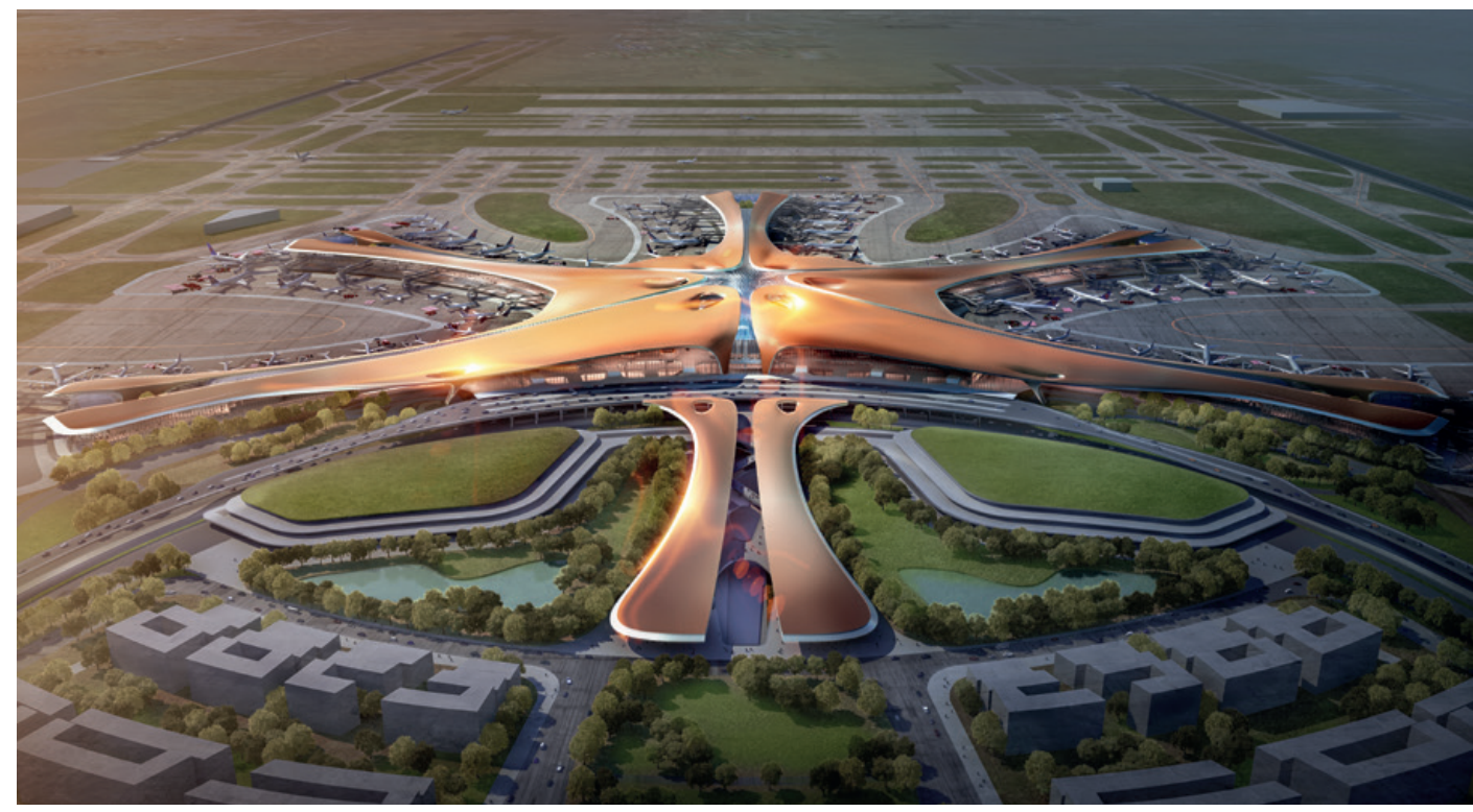
ZAHA HADID ARCHITECTS: Beijing New Airport Terminal Building, Daxing, Beijing, set to become the world's largest airport passenger terminal

the UK economy forward, if they are implemented. Projects include the new GBP50bn High Speed 2 rail connection from London to Birmingham with onward connection with Manchester and Leeds.