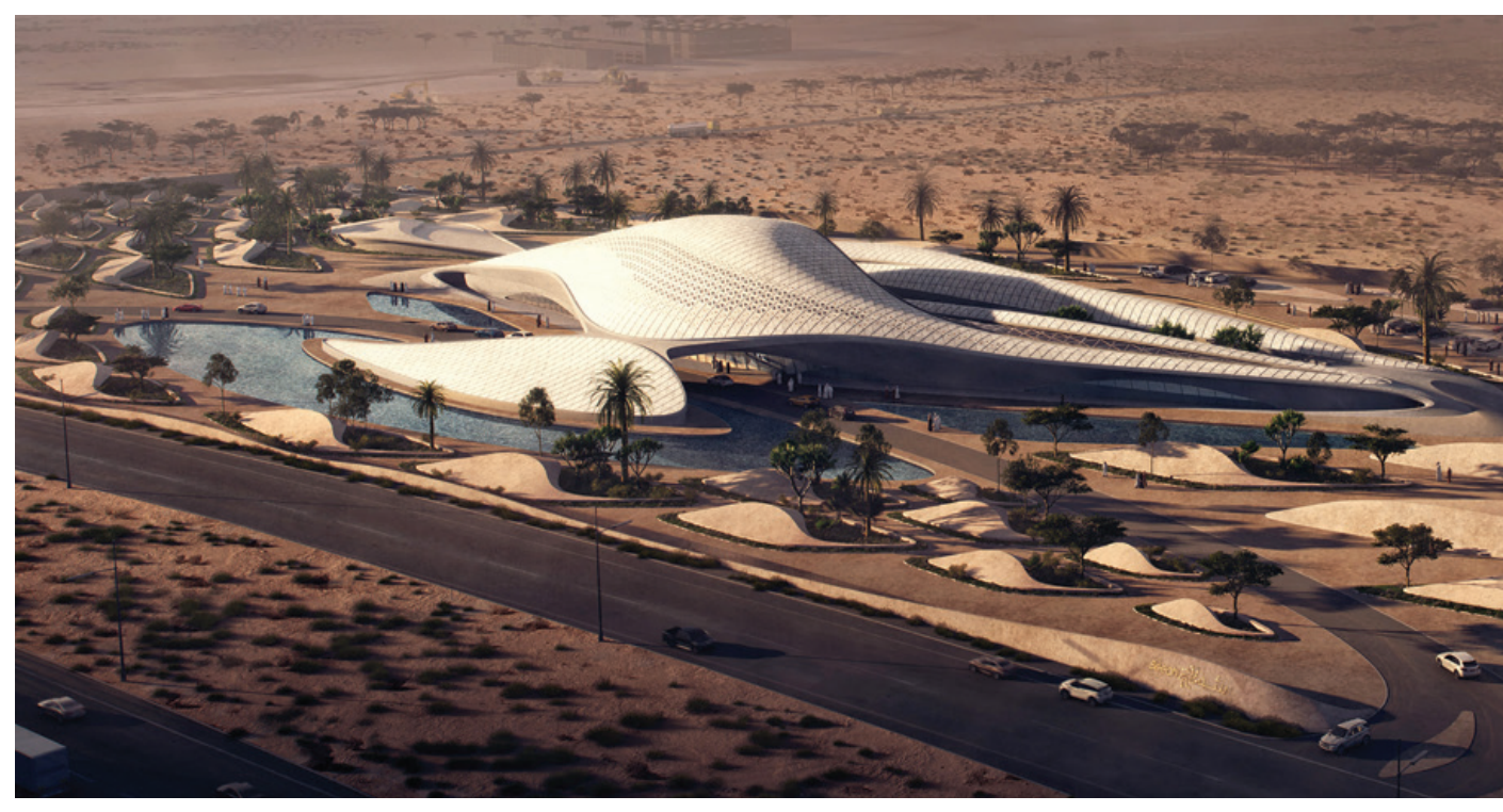
ZAHA HADID ARCHITECTS: Bee'ah Headquarters, Sharjah, UAE. The new Headquarters building is part of the Bee'ah's ongoing investment to transform attitudes and behaviours to support to achieve Zero-Waste to landfill targets. The Bee'ah School of Environment (BSOE) has hosted to date 174,000 children in over 210 schools across the emirate. Bee'ah Headquarters is LEED Platinum with ultra-low carbon and minimal water consumption

In France, and Italy, construction activity is expected to remain at 6% and 11% below pre-crisis levels respectively by 2030. Both France and Italy suffer from tighter public finances than Germany and also have an inability to push through the necessary reforms to improve business competitiveness and ultimately drive growth.