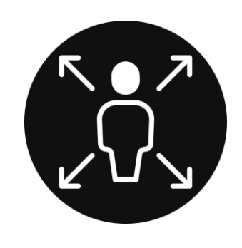
Quality and Health & Safety